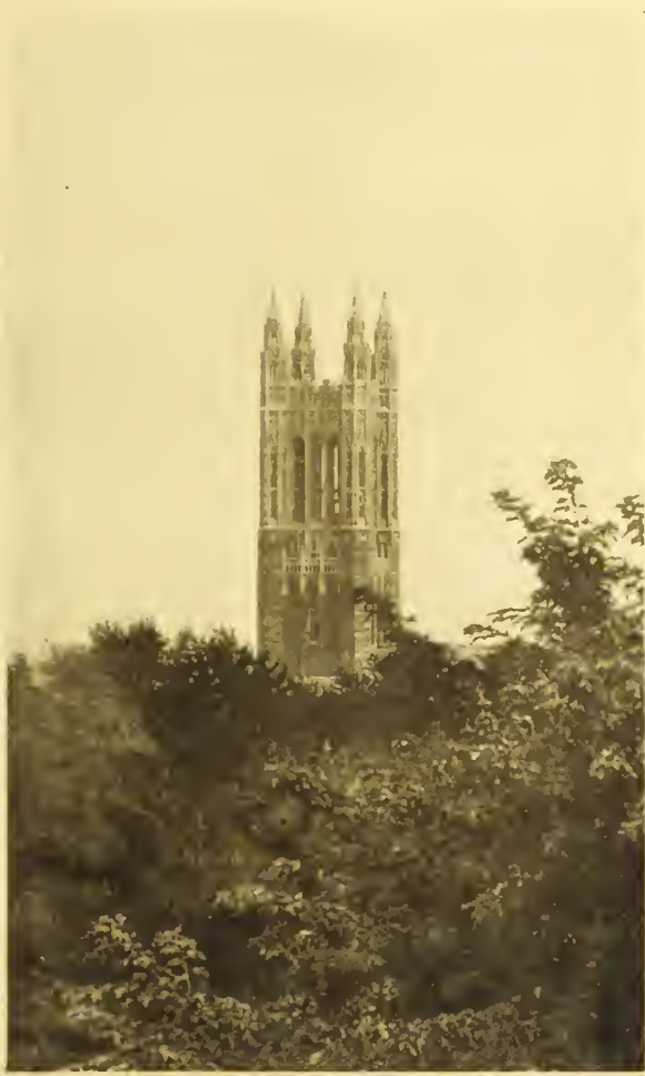
Cleveland Tower Graduate College, Princeton University